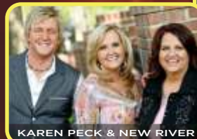
KAREN PECK & NEW RIVER